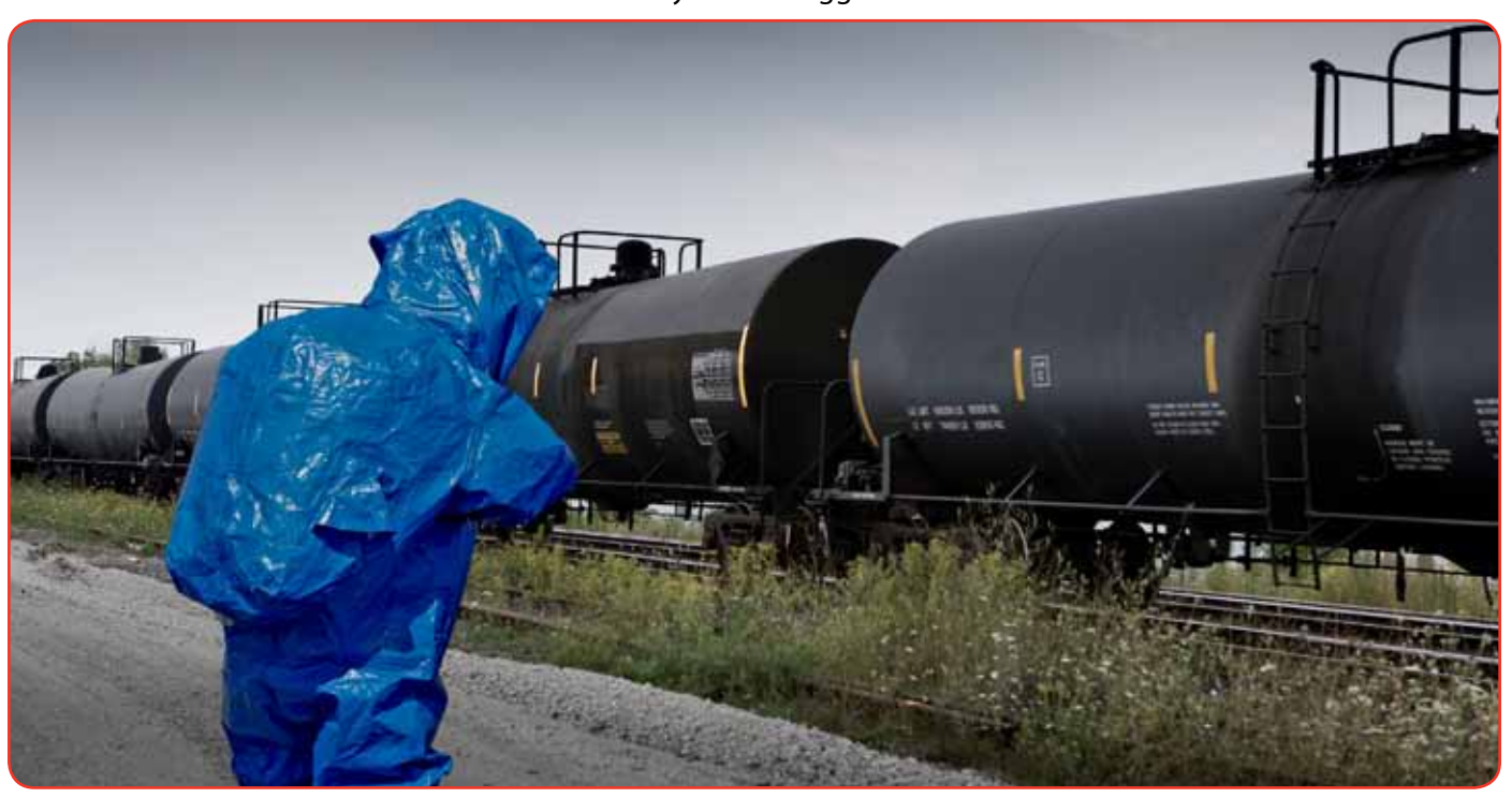
In the event of a hazardous materials leak, specialized equipment must be utilized to mitigate the risks