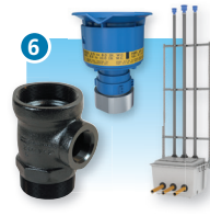
6 Tank Vents, Vent Transition Sumps, Extractor Fittings