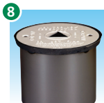
Cast-Iron Manhole Covers