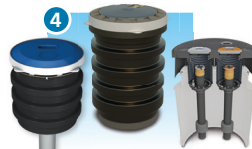
4 Spill Containers, MultiPorts, Caps, Adaptors