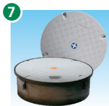
Composite Manhole Covers