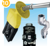
Hanging Hardware Kits including Nozzles, Swivels, Breakaways and Hoses