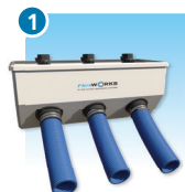
1 Dispenser Sumps (Loop or Conventional)