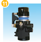
Emergency Shut-Off Valves