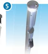
5 Overfill Prevention, Shut-Off Valves