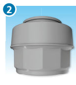
2 Tank Sumps