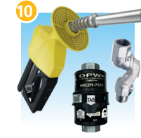
10 Hanging Hardware Kits including Nozzles, Swivels, Breakaways and Hoses