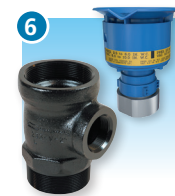
6 Tank Vents Extractor Fittings