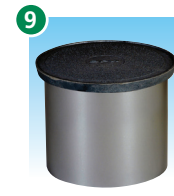
9 Steel Manhole Covers