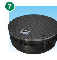
7 Composite Manhole Covers