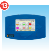
13 SiteSentinel® Nano with Probes and Sensors