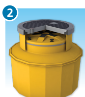
2 Tank Sumps