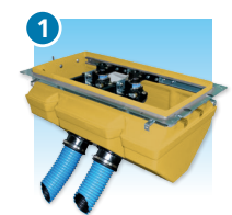
1 Dispenser Sumps (Loop or Conventional)