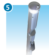
5 Overfill Prevention, Shut-off Valves