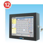
12 SiteSentinel® Integra with Probes and Sensors