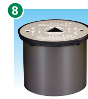
8 Cast-Iron Manhole Covers