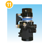
11 Emergency Shut-Off Valves