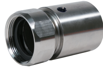
Double Wall Pipe Coupling (DPC Model)