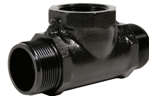
Tee (STF Model)