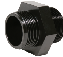
Adaptor (SMA Model)