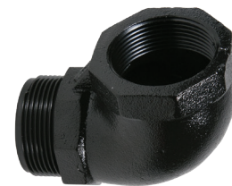
Elbow (SEF Model)