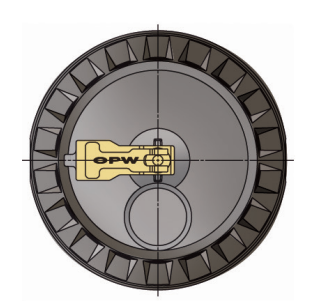
Watertight Sealable Cover