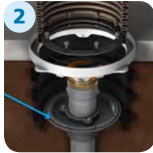
2 Remove Lower Bolts and Ring and Remove Bellows