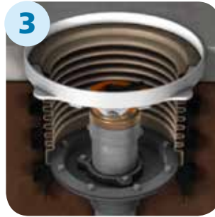
3 Replace Bellows, Reinstall Upper and Lower Rings

No Need to Remove Base in order to Replace Bellows