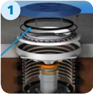
1 Remove Upper Bolts and Ring