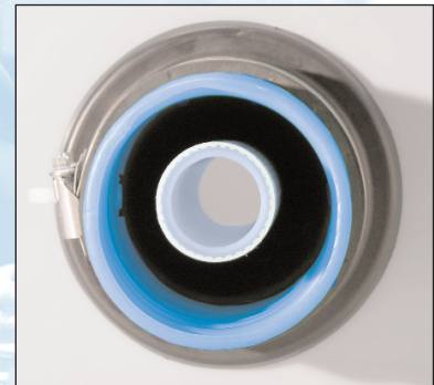
The outside boot seals to the primary, secondary or chase pipe

OPW Fueling Containment Systems double wall entry boots seal both pipe and conduit entries into containment sumps.