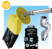
Hanging Hardware Kits including Nozzles, Swivels, Breakaways and Hoses