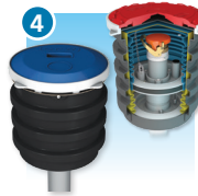
Spill Containers, Caps, Adaptors