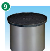
Steel Manhole Covers