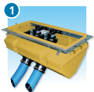
Dispenser Sumps (Loop or Conventional)