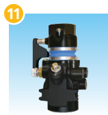
Emergency Shut-Off Valves