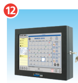
SiteSentinel® Integra with Probes and Sensors