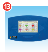
SiteSentinel® Nano with Probes and Sensors