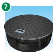
Composite Manhole Covers