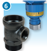
Tank Vents Extractor Fittings