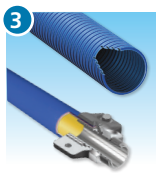
FlexWorks Piping FlexWorks Pipe Coupling