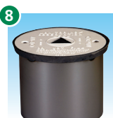
Cast-Iron Manhole Covers