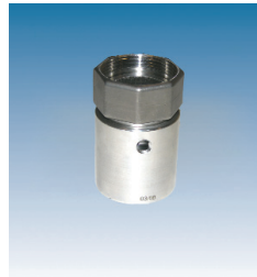
Double Wall Coupling (DPC Series)

Over the years OPW-FCS has developed a variety of specialty components for retrofitting old degraded TCI parts, without the need for excavation.