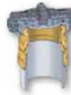
OPW 615A- Rotatable Swivel Adaptor - Fill Port