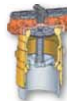
OPW 61VSA- Rotatable Swivel Adaptor - Vapor Port