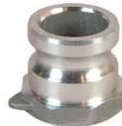
633AST Spout Adaptor

633FAST-XXXX, Male Thread Equivalent of Adaptors above