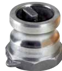
633AST Spout Adaptor