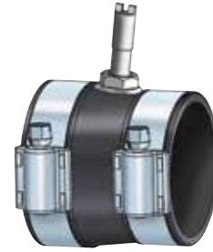
Models TBA-0075, TBA-0100, TBA-0150, TBA-0200 and TBA-0300