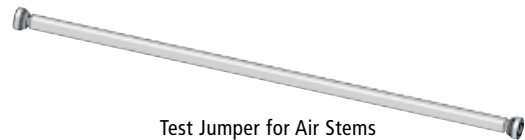
Test Jumper for Air Stems (TJ-200A)