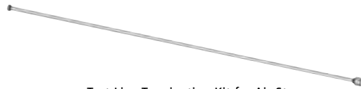
Test Line Termination Kit for Air Stems (TLT-36A)