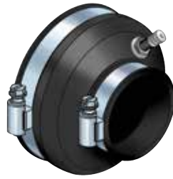
Models TBA-3015, TBA-3020, TBA-4015 and TBA-4020

FlexWorks Test Boots are used to isolate and air-test the interstitial space between the primary and secondary pipe. One test boot is required for each pipe end.