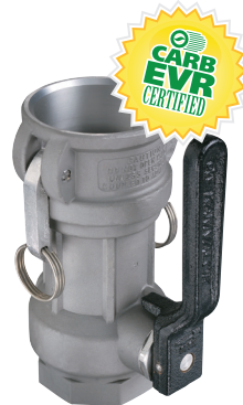
Poppeted Kamvalok® Couplers

H32116PA Coupler Instruction Sheet Order Number: 204016