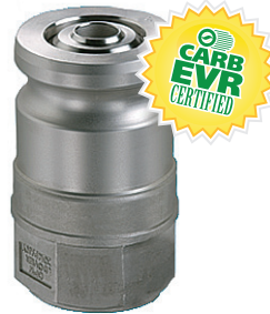
Poppeted Kamvalok® Couplers for Remote Fill

1611AN Adaptor Instruction Sheet Order Number: 204016