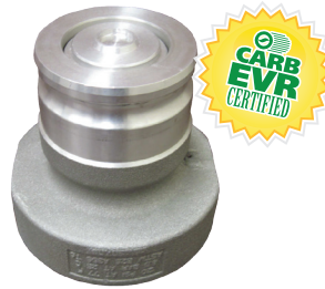
Kamvalok® Adaptor for Direct Fill

1611AN Adaptor Instruction Sheet Order Number: 204016