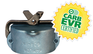
Lockable Dust Plug