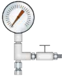
Test Gauge Assembly (TGA-15)