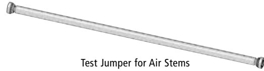
Test Jumper for Air Stems (TJ-200A)