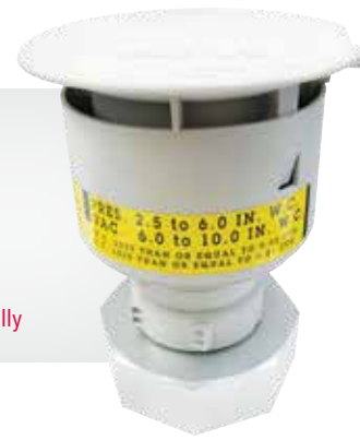
623V Vent Must Be Mounted Vertically