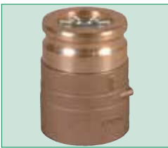
61VSA Vapor Recovery Swivel Adaptors

The adaptor and cap dimensions below reflect the overall height and installed height of OPW adaptors and adaptor and cap combinations. The installed height is from the gasket seal to the top of the component. For example, the 61VSA height is 6 1/2", but only adds 4-7/8" to the overall height when added to the riser.