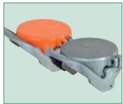
634LPC Fill and 1711LPC Low Profile Caps

Overall Height Installed Height 2-9/16" 1-1/2"