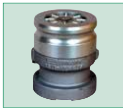
1611AV Standard Vapor Adaptors

Overall Height Installed Height 6-1/2" 4-7/8"