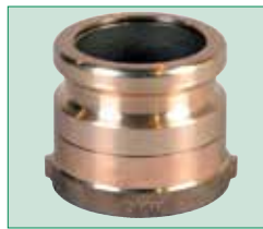
61SALP Fill Swivel Adaptor

Overall Height Installed Height 5 7/16" 4-3/4"