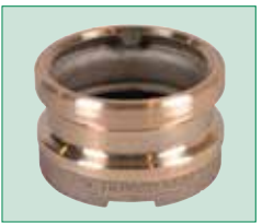
633T Standard Fill Adaptor

Overall Height Installed Height 4-3/8" 2-7/8"