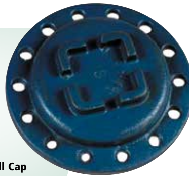
83 Fill Cap

Body: ZA alloy Cap: Cast iron Gasket: Nitrile