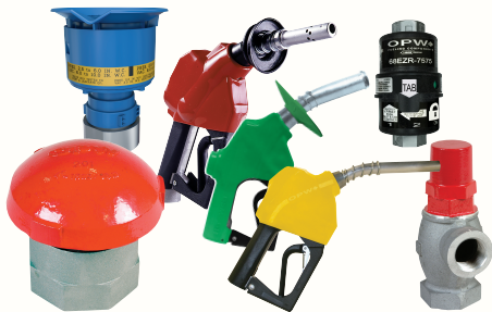
Above Ground Products

Setting the industry standard in retail and commercial fueling solutions worldwide since 1892.