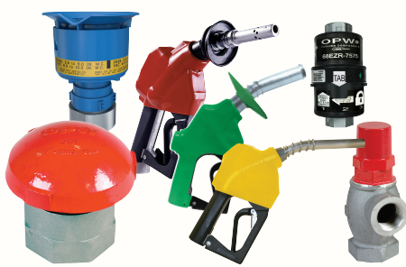
Above Ground Products

Setting the industry standard in retail and commercial fueling solutions worldwide since 1892.