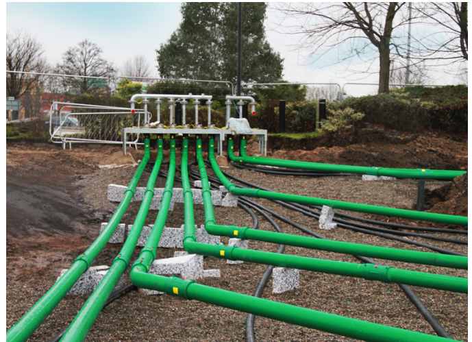
KPS formed bends below fill point