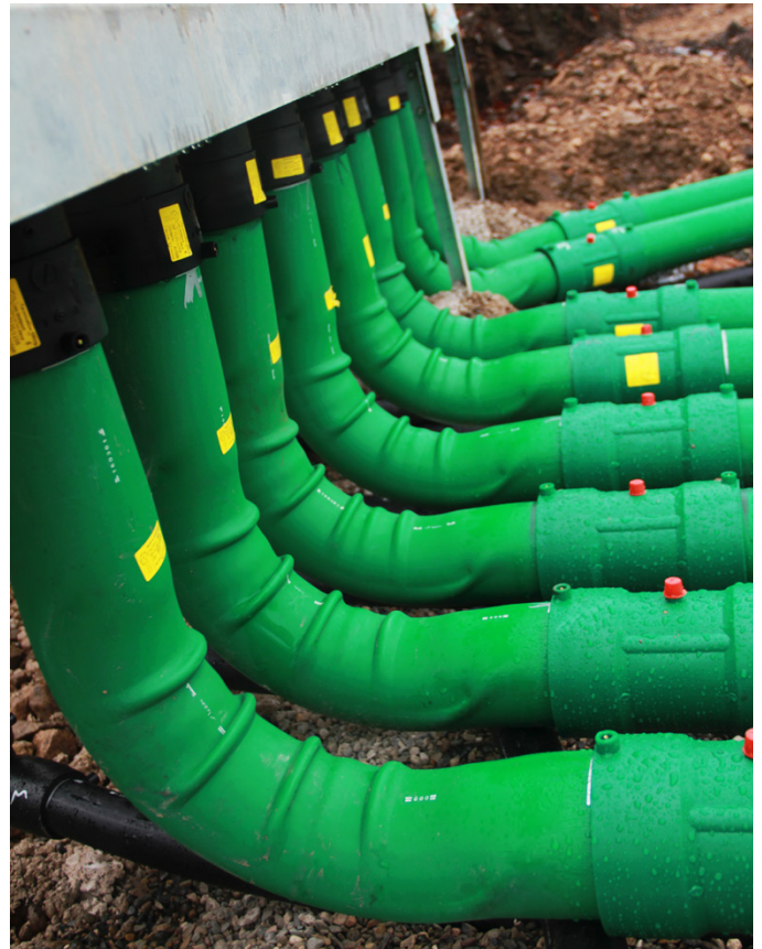
KPS bends below fill point

In case of collision with or fire at one of the dispensers once the station was completed, a solution to cut off fuel flow was required.