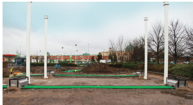
Client had a distance of 10m between pump islands

A leading membership-only wholesaler approached OPW to provide an easy to install, reliable, fuel piping solution specifically adapted to their station configuration. Safety during and after installation were of utmost importance.