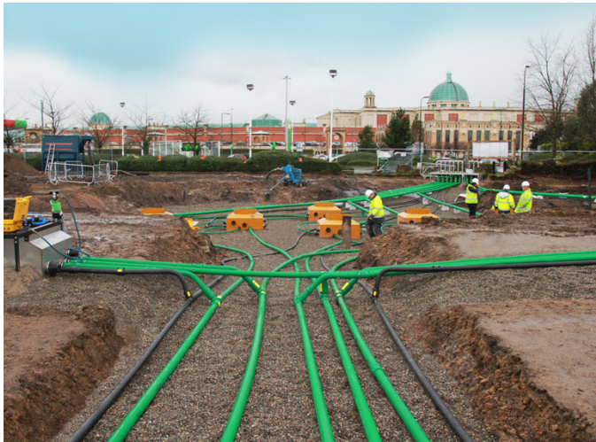
North England site under construction