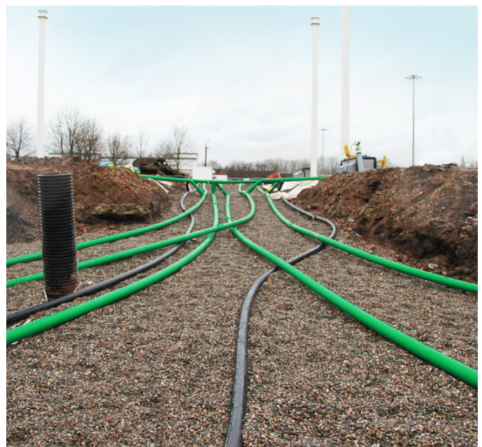
KPS pipe is also available in coils