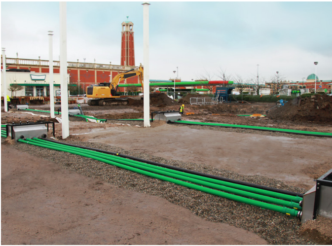
10m lengths of custom 75/63mm KPS straight pipe allowed fast installation without the need for a welding socket in middle