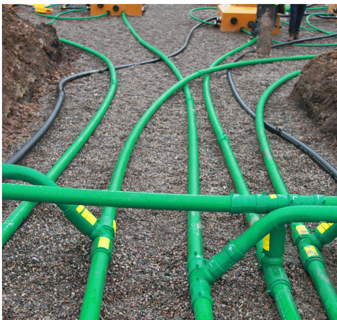
All integrated double wall KPS fittings weld both pipe walls simultaneously

OPW 10 series emergency shut-off valves were installed on fuel supply lines beneath dispensers at grade level to minimize hazards associated with collision or fire at the dispenser. If the dispenser is pulled over or dislodged by collision, the top of the valve breaks off at the integral shear groove, activating poppets and shutting off the flow of fuel.