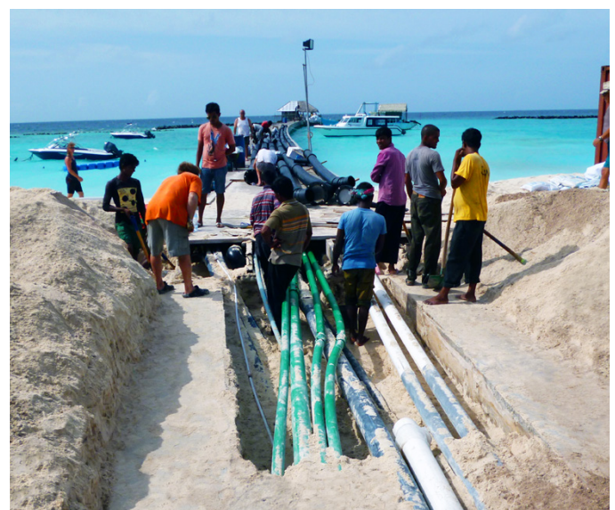
Installer friendly KPS piping allowed for quick easy installation