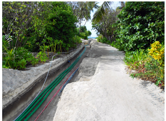
Installed piping from fuelling jetty to storage tanks ready for burial

Piping is installed on hanging mounts below jetties allow an efficient fuelling process. The double wall piping ensures no permeation of fuel into surrounding environment. KPS pipe is completely un-reactive to saltwater, eliminating the risk of deterioration with constant exposure. Conductivity ensures safe grounding in the event of sparks or static electricity generated while fuelling.