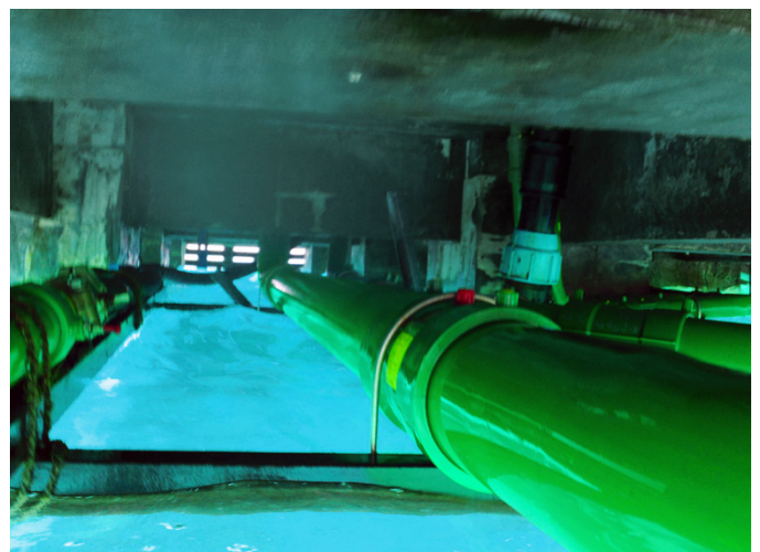
KPS piping is impervious to corrosion from saltwater

For more information on the OPW product range please contact us: