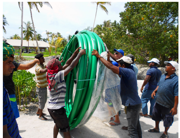
Unwrapping the KPS 75/63SCEC double wall fuel coil for the new fuel line