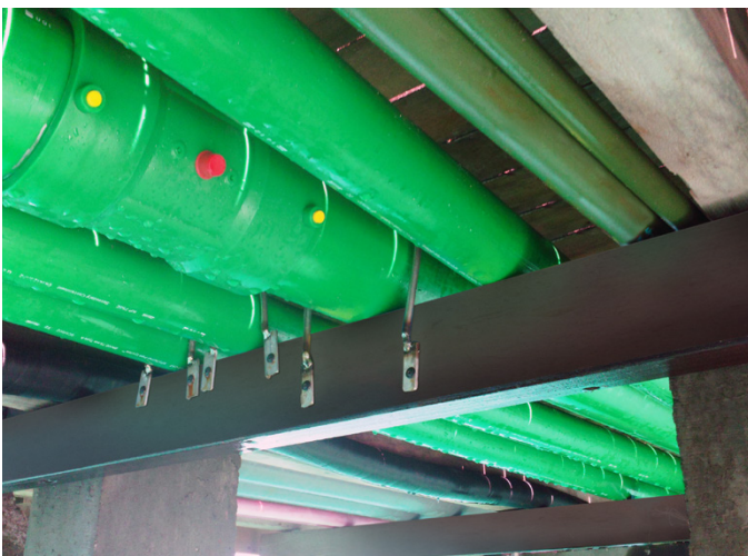
Fuelling lines run below jetty from ship to storage point

Installation went smoothly and finished on schedule. Now the island and holiday resort have a reliable discreet energy source with no danger to surrounding wildlife.