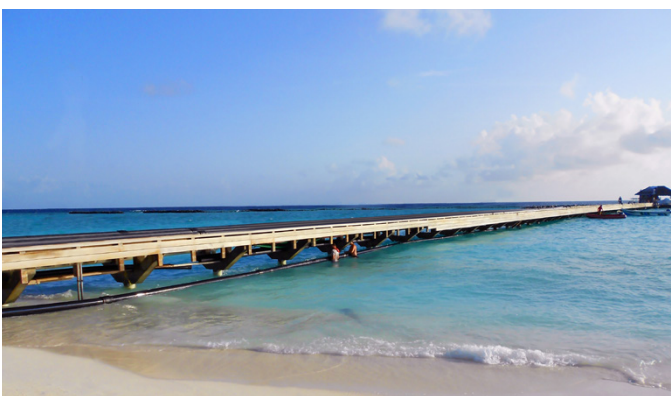
Fuel delivery jetty: piping has constant exposure to saltwater