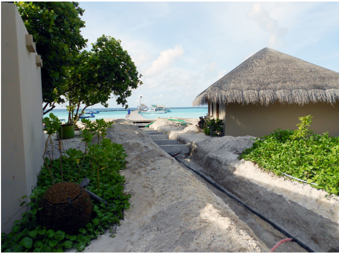
Maldives island's energy is dependent on shipped in fuel