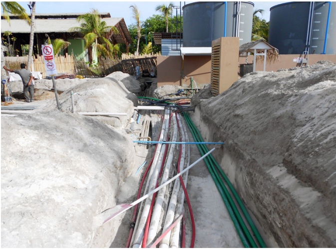
Fuelling lines running from jetty to storage point