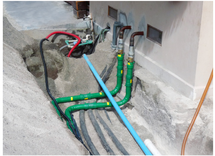
Refuelling lines running from storage point to jetty