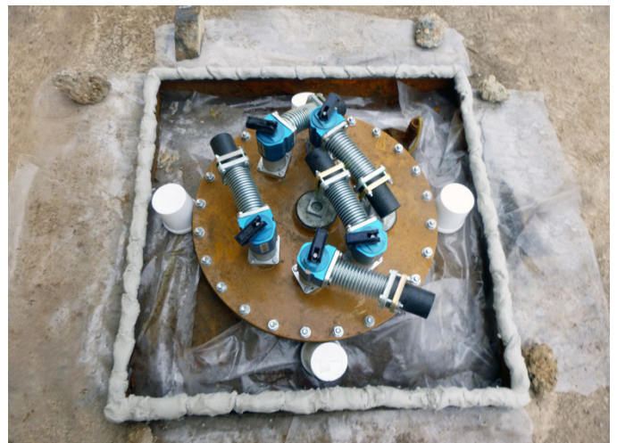
Preparation of surface for putty