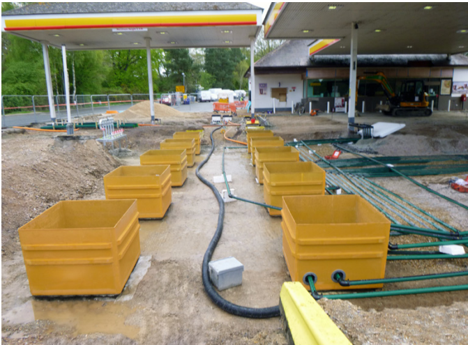
Fibrelite tank sumps bonded to existing tanks using bespoke bonding system