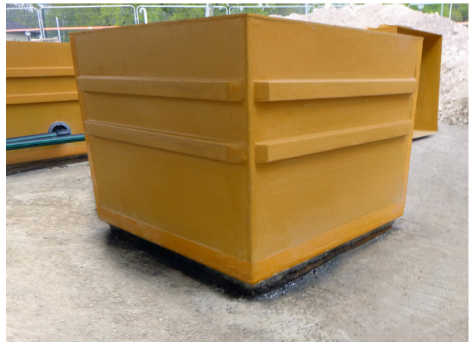
Fibrelite tank sump mounted on old tank upstand