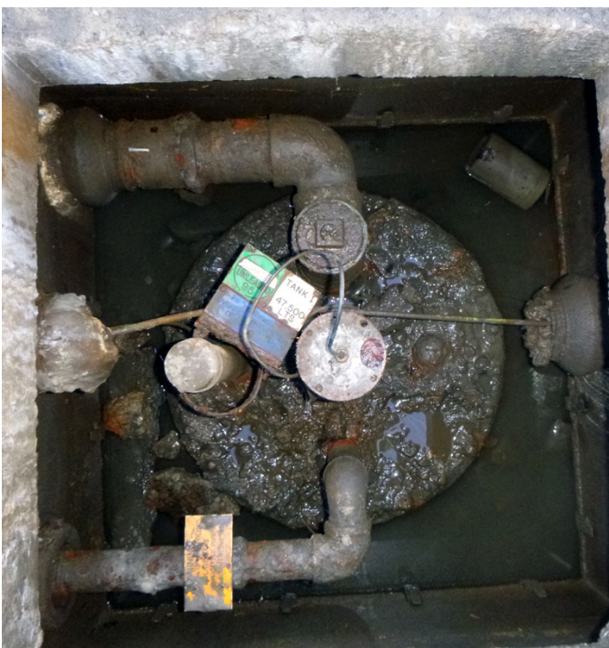
At this site, the old tank upstands were too small for the traditional bolt down tank sumps / chambers

The OPW Fibrelite site team used an epoxy putty compound to lay onto the tank collar before carefully placing the chamber on top, bonding the chamber to the upstand. Preparation of surfaces before bonding was key.