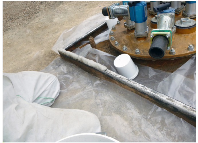
Epoxy putty compound