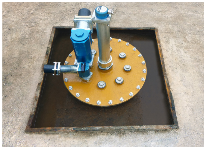
OPW's Fibrelite team came up with a solution to chemically bond the GRP square chambers onto the old tank upstands