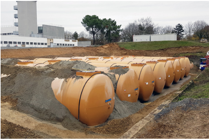
A demanding district heating redevelopment project in Rennes, France