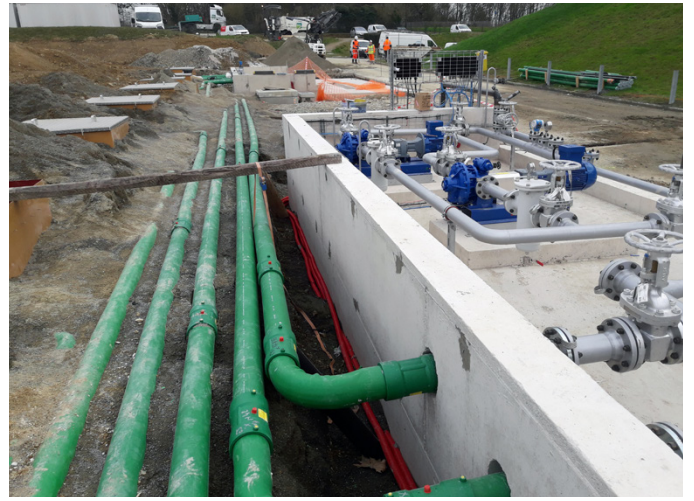
Fibrelite's long lasting watertight vent transition sumps and KPS conductive piping