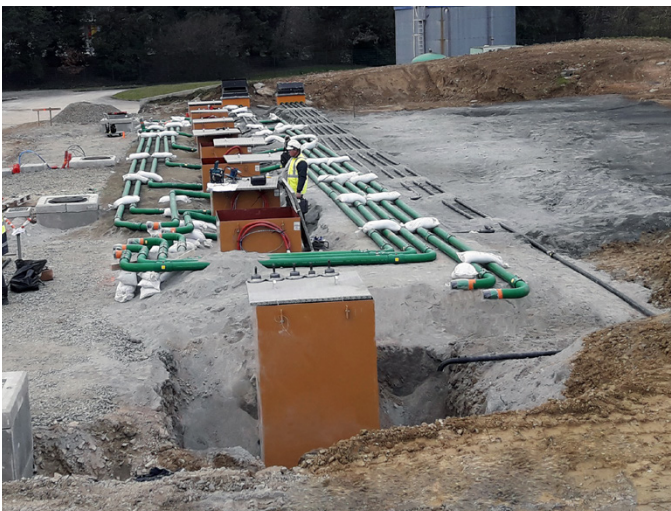
OPW provided a tailormade KPS piping solution

Bespoke pipework for existing narrow steel chambers was required. This often poses a problem to pipe suppliers, many of which can only supply standard products. A Fibrelite vent transition sump was also required.