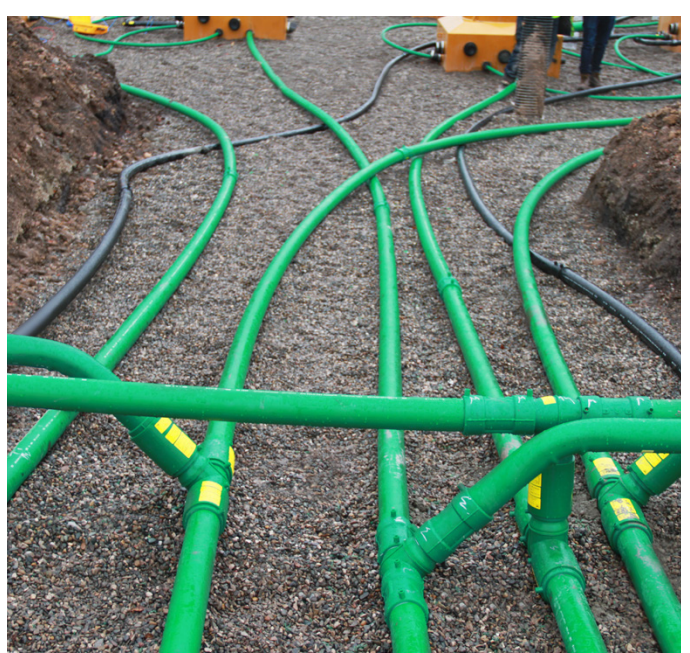
All integrated double wall KPS fittings weld both pipe walls simultaneously