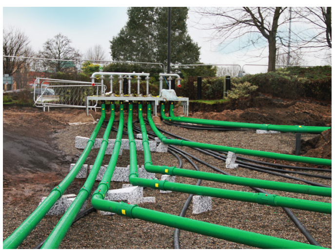
KPS formed bends below fill point