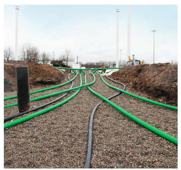
KPS pipe is also available in coils

OPW 10 series emergency shut-off valves were installed on fuel supply lines beneath dispensers at grade level to minimize hazards associated with collision or fire at the dispenser. If the dispenser is pulled over or dislodged by collision, the top of the valve breaks off at the integral shear groove, activating poppets and shutting off the flow of fuel.