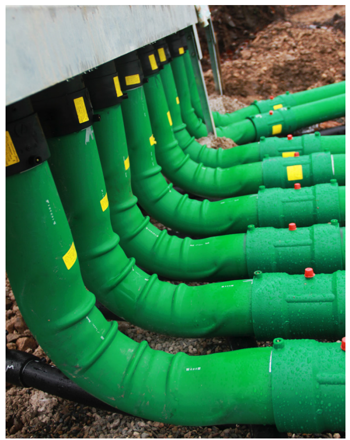
KPS bends below fill point

US Office: Tel: +1 800 422 2525 Email: enquiries@opwglobal.com