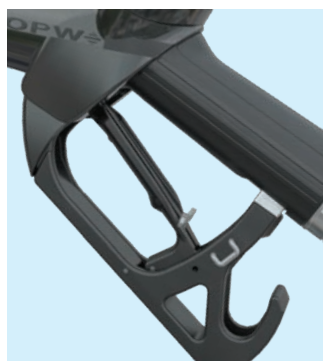
Ergonomic handgrip, easy-to-activate and hold-open latch