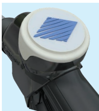
Large (47mm), interchangeable message center for branding or promotions. Side tab available for fuel identification

For full nozzle and swivel part numbers, see specification brochure