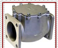
3" Check Valves