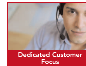
Dedicated Customer Focus