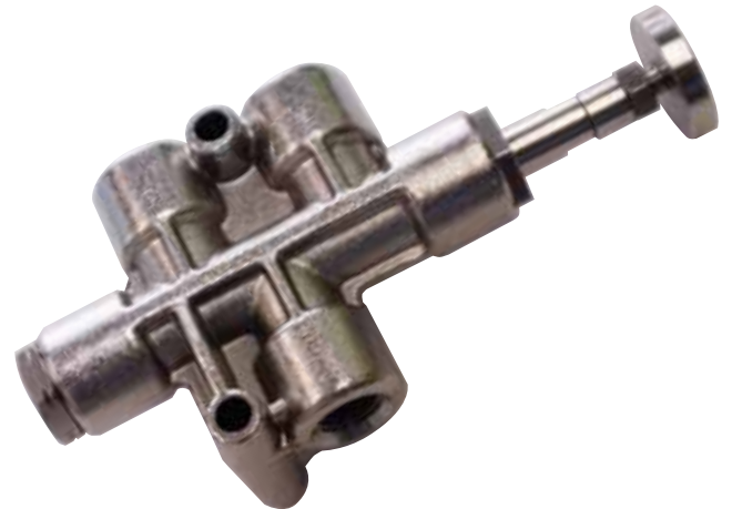
Air Interlock Valve Model 200