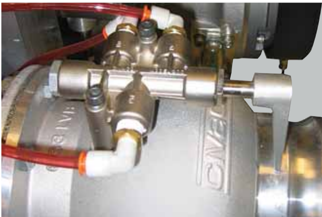
Air Interlock Valve Model 201

The Model 200 and 201 air interlock valves are installed on bottom loading adaptors and vapor recovery fittings to lock the brakes to prevent drive-aways during loading. This pneumatic valve can be used in a number of different applications for additional safety features.