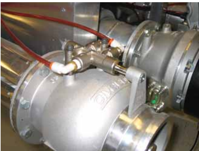
Vapor Recovery Adaptor with Air Interlock Valve Model 201