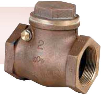
Swing Check Valve

Body: Bronze Seat Ring: Brass Disc: Viton® Cap: Bronze