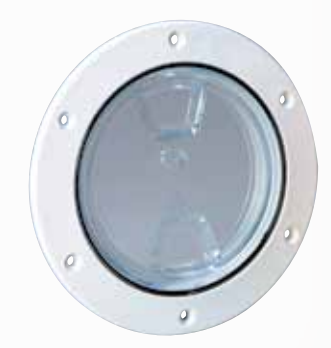
4" Sump Inspection Port (SIP-4) Includes Urethane Sealant (SL-1100)