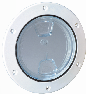
4" Sump Inspection Port (SIP-4) Includes Urethane Sealant (SL-1100)