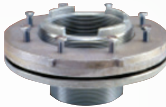
4" Tank Fitting Adaptor – No-Bolt Style (TFA-4090)