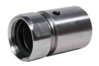
Double Wall Pipe Coupling (DPC Model)

These double-wall couplings permit higher interstitial testing pressures and eliminate added parts and labor costs.