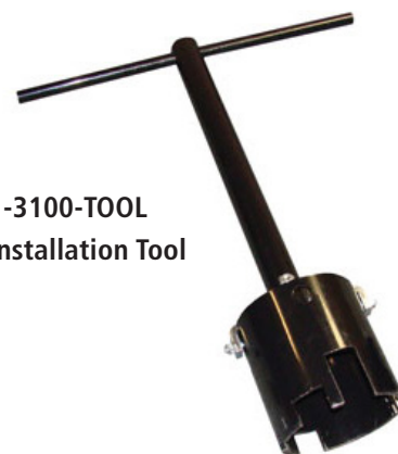
1-3100-TOOL Installation Tool