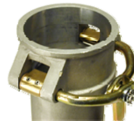
SureLok™ Cam Mechanism