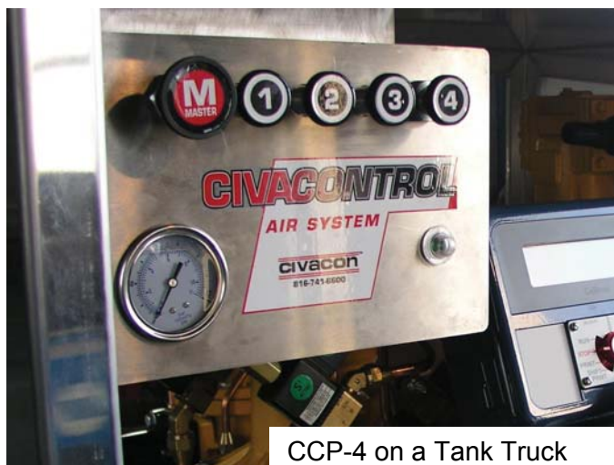
CCP-4 on a Tank Truck