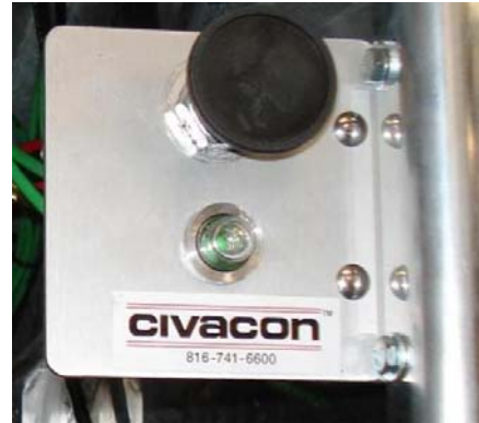
CCP-1 used as a Load Valve to release the Guard Bar Lock over APIs. Pop-Up confirms Vapor Vents are "open".

CivaControl is the central component of our System 3 complete tank truck or trailer loading and unloading system. The full benefit of these purpose-built controls are best realized when installed along with, and integrated into, the rest of our Civacon System 3 pneumatic tank truck components to form a total safety and interlock system. (Pneumatic Vapor Vents, Emergency Valves, API Adaptors, Vapor Recovery Connections, Electronic Overfill Detection, Manifolds, Guard Bars and Guard Bar Interlocks).