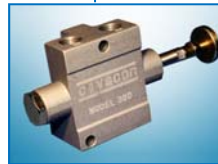
Air Interlock Valves