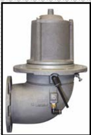
5\"X4\" MaxAir II