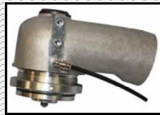
Crude Oil Vapor Vents