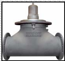
6\"x 6\" Crude Oil Valves