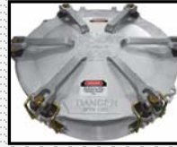
LM Manhole Covers