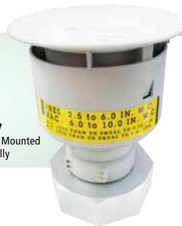
623V Vent Must Be Mounted Vertically