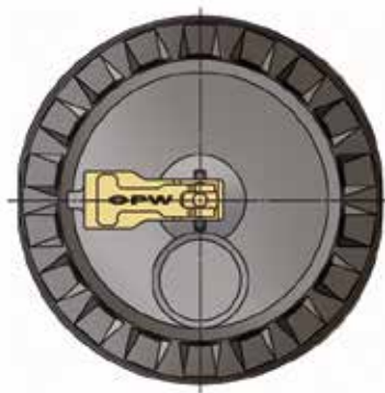
1DK-2100 Drain Valve Kit Instruction Sheet Order Number: H11471M