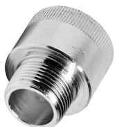
28S-0350 Bushing Adaptor