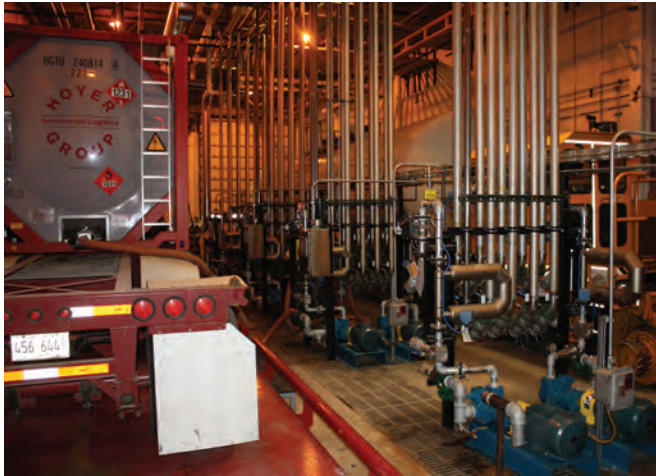
EMCO's side-by-side tank-truck and railcar loading/unloading dock features numerous loading racks that are dedicated to specific products or raw materials. To ensure that the highest level of safety is realized during a loading or unloading operation, quick-disconnect technology from OPW Engineered Systems is used.