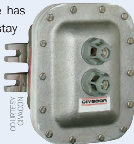
Civacon Model 8030 Ground Verification Monitor System

At some point, everyone has been reminded to “stay grounded,” or to not let success go to one’s head. In the world of chemical handling and transfer, staying grounded can have life-or-death consequences. Many of the chemicals that are shipped, pumped, transferred, loaded, and unloaded can be hazardous, meaning they must be properly contained and handled in the