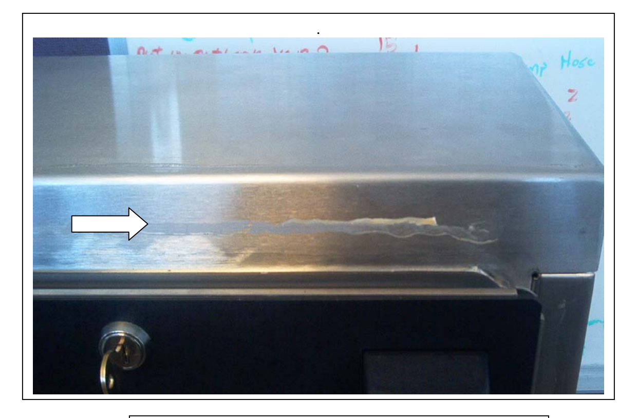
Figure 1. Clean Old Adhesive