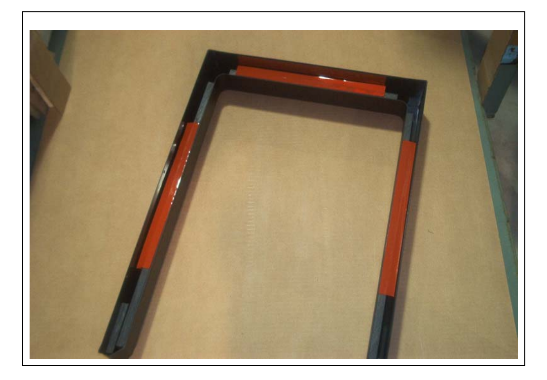
Figure 3. Remove Backing From 3M Tape